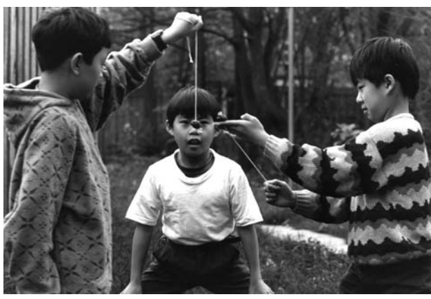
Conkers, [MS2512]