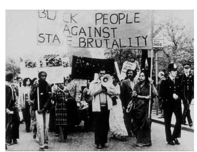
Photograph of a protest march, from the IWA archive [MS2141]

Correspondence, newscuttings and other papers, from 1961 onwards, of the national organisation and the Birmingham branch. Both groups were active in challenging racism locally and nationally, and campaigned against the immigration laws of the 1960s and 1970s. The Indian Workers Association was also involved in trade union struggles and Indian politics.