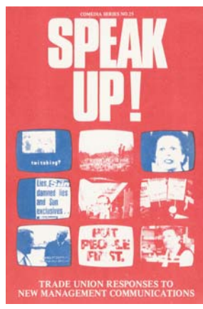
TURC publications [MS2118 and MS2009]

The Birmingham Trade Union Resource Centre [TURC] focused on issues associated with working life. This was widely defined and extended to employment and unemployment rights, issues of discrimination, privatisation, poverty, unionism, trade, health, environment, youth, sexuality, gender, international and cultural issues, and national and local government policies. The records show their diversity of concerns, campaigns and activities.