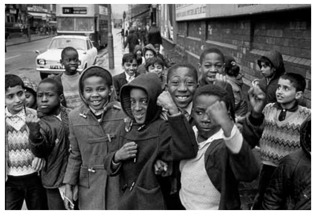
On the streets in Handsworth © George Hallett, 1971 [MS2249]

Photographs of Handsworth taken in 1971 by internationally renowned South African photographer George Hallett, then living in exile in London, to illustrate a Times Literary Supplement entitled 'Handsworth: Caribbean Black Country'. The article dealt with many issues highlighted in the Runnymede Trust's report 'Race in the Inner City'. Hallett has now returned to South Africa and recently photographed the Truth and Reconciliation process.