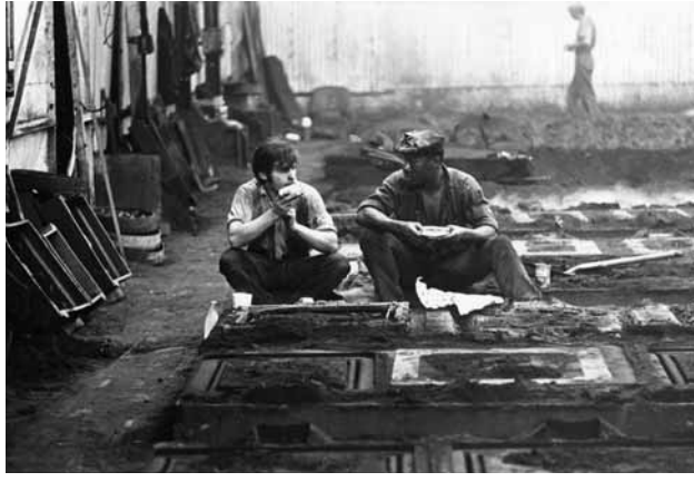
Lunch break at Dudley & Dowell Foundry, Cradley Heath