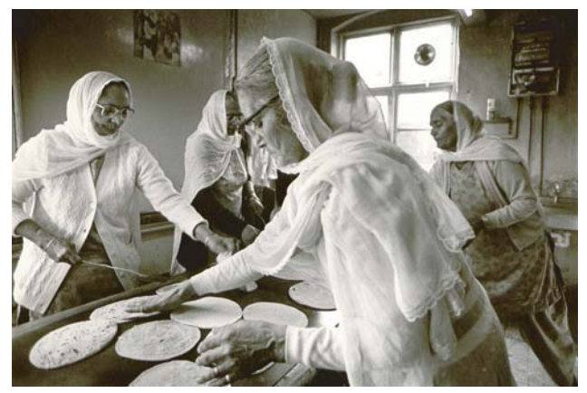
Smethwick Gurdwara, 1982, 'Home Front' [MS2478]