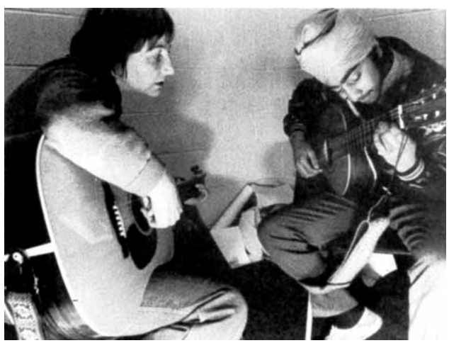
Photograph taken during the Handsworth Community Project [MS1611]

The vast archive of the campaigning socialist theatre company Banner Theatre illustrates how performance can be used as a political tool. Founded in 1974, Banner's productions campaign against inequality and racism and are based on individual stories recorded through photographs, sound and video, all of which is preserved in their archive.